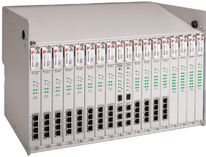
AK500S with AK590CC Common Controller and AK525LC / AK626LC Line Cards

The FlexStream AK500S point-to-multipoint system enables the transport of high-quality, high-bandwidth Ethernet services over bonded copper pairs. It provides 100 Mbps of high-bandwidth per AK525LC / AK525LCPA line cards and up to 800 Mbps per AK626LC line cards enabling the delivery of carrier-grade service throughout service provider networks (12 Kft/ 3.7 Km) and beyond.