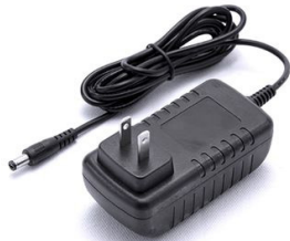
12V wall adapter